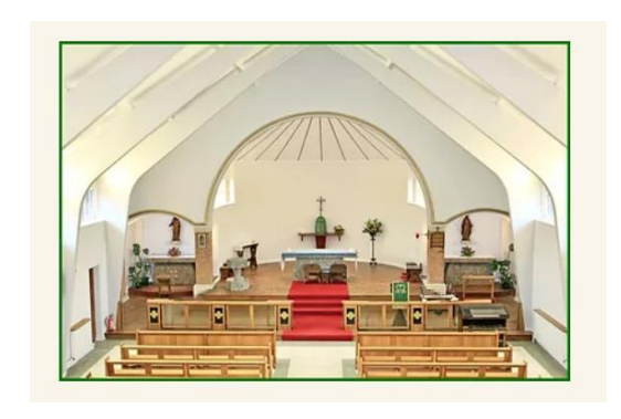
ST GREGORY'S CATHOLIC CHURCH, KINGSKERSWELL

At a time when you're in mourning it is sometimes hard to know the answers to some questions about what happens at a Catholic funeral so please take the time to read this guide which we hope will alleviate any worries or concerns you have with regard to what your loved one, as a Catholic, will have hoped for at the time of their passing.